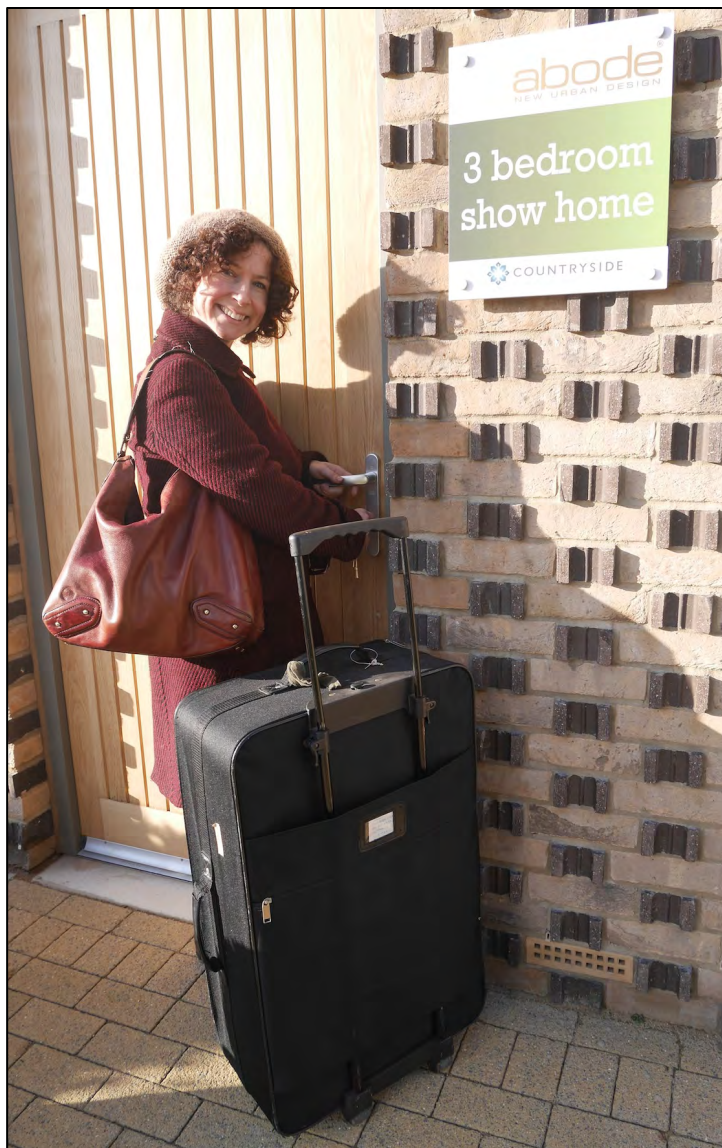
'Moving in' to 93 Addenbrookes Road

The Habitorials magazine marks the launch of a year-long programme of artist led events for local residents. Called " Showground of Real Living ", the events will run from 93 Addenbrooke's Road . The aim is to bring together residents new and old.